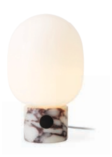
Calacatta Viola Marble 1830319