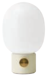
Alabaster White, Steel 1800360