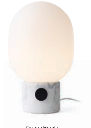
Carrara Marble 1830639