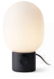
Black Steel 1810539