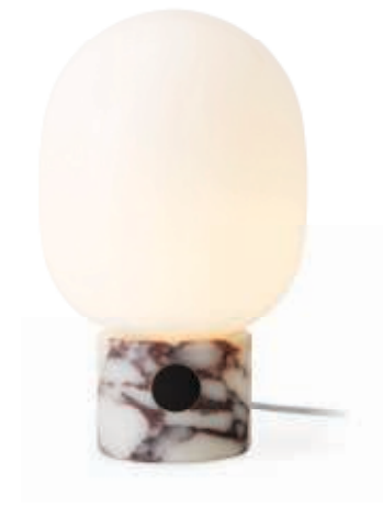
Calacatta Viola Marble 1830319