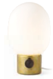
Polished Brass 1800839