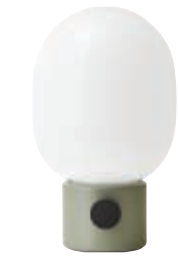
Ammonite Grey, Steel 1800089