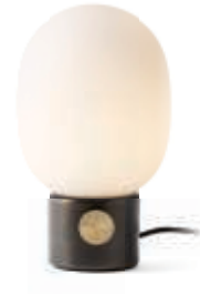
Bronzed Brass 1800859